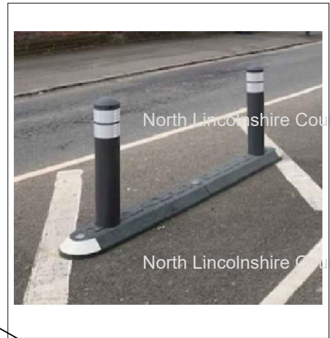
Rediweild Milestone Island